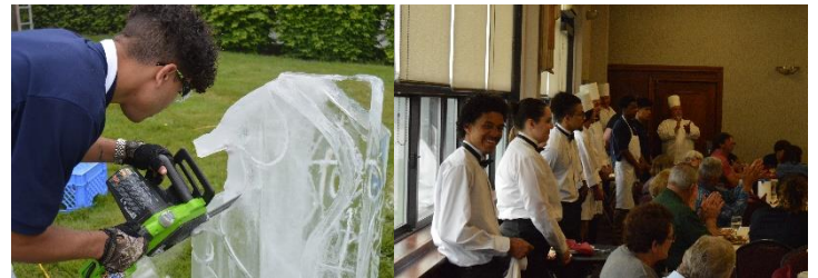
Ocean Tides Annual Gala Luncheon showcased Culinary Arts students and included student ice carvings.