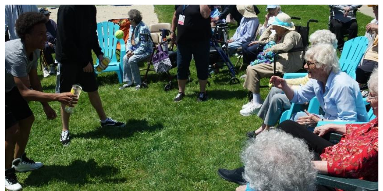
Ocean Tides Students welcome guests from Senior Centers where they do community service all year to a picnic and field day at Ocean Tides every May.

Ocean Tides Narragansett Campus Program Information Flyer is available at this link: http://www.oceantides.org/wp-content/uploads/2018/06/Spring-2018-program-flyer.pdf